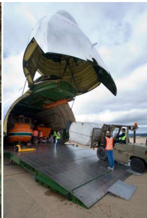
Above left: Google Earth image shows the impact of aircraft noise on the Canberra Region. Above Right: Freight operations at Canberra Airport.

There has been unprecedented interest in the Master Plan with over 230 submissions from community, business, government and industry sectors, demonstrating a high level of interest in the development of the airport and its role as a national gateway.