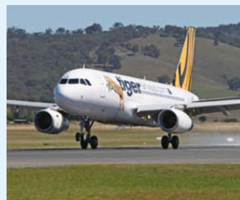
Tiger Airways to stay in Canberra for now.