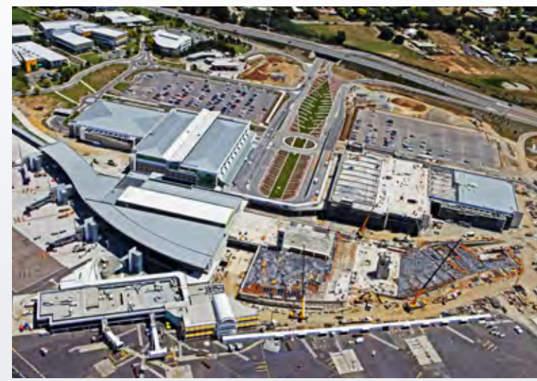
ABOVE STAGE TWO UNDER CONSTRUCTION OF CANBERRA'S NEW AIRPORT TERMINAL.

"Canberra Airport's curfew-free status is critical to that role. If those flights had been delayed until after 11pm, they would not have been able to return to Sydney but could have landed safely in Canberra with passengers inconvenienced but not having their safety compromised."