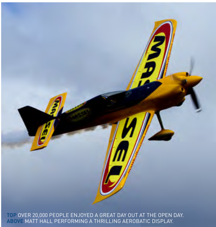
TOP OVER 20,000 PEOPLE ENJOYED A GREAT DAY OUT AT THE OPEN DAY. ABOVE MATT HALL PERFORMING A THRILLING AEROBATIC DISPLAY.